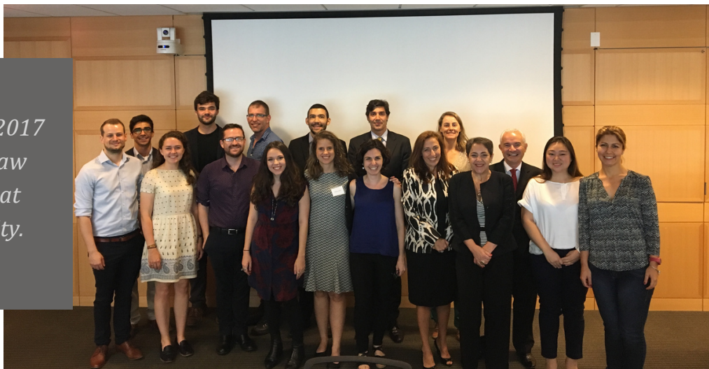
Participants at the 2017 IRGLUS / Urban Law Center workshop at Fordham University.