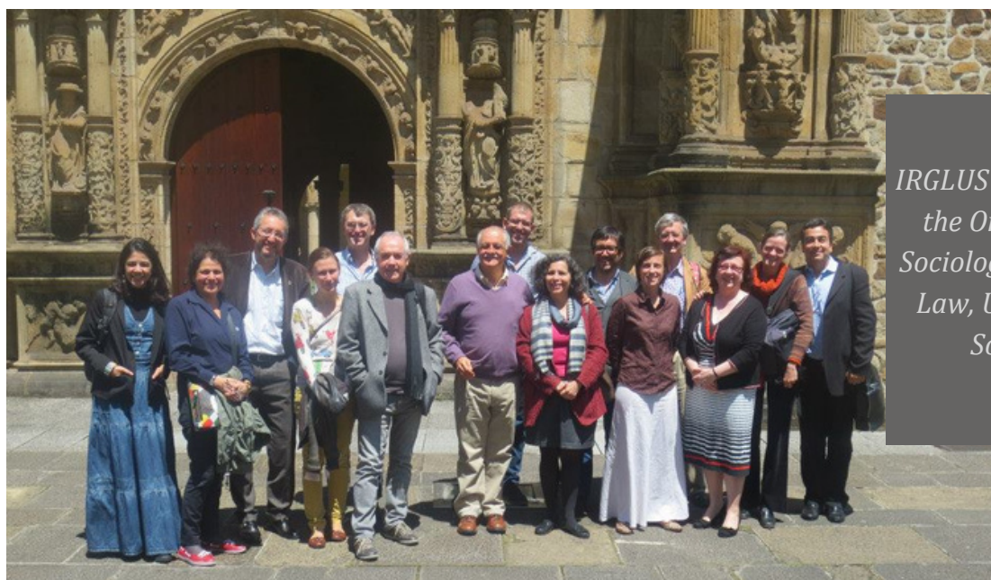
IRGLUS workshop 2014 at the Oñati Institute for Sociology of Law, entitled Law, Urban Space, and Social Justice.,

IRGLUS and WIEGO co-hosted an online author’s workshop for their joint book project entitled Mapping Legalities: Law, Urban Space, and Informal Work in January 2022.